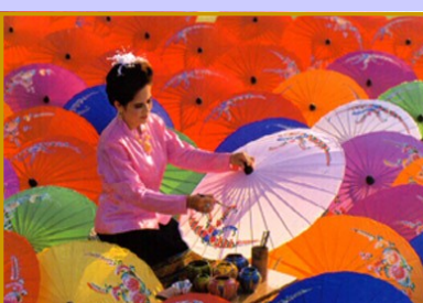
Bo Sang Handicraft