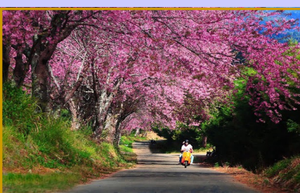
Baan Khun Chang Kian