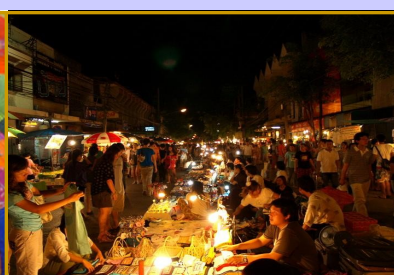
Chiang Mai Night Bazaar