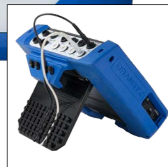
Easel and Wire Management

Innovative Package & Wide Screen 7" color, wide screen touch display. 40% larger than before - the largest in the industry!