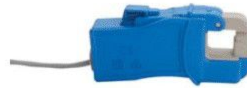
TR-2510B 1A-10ARMS CT