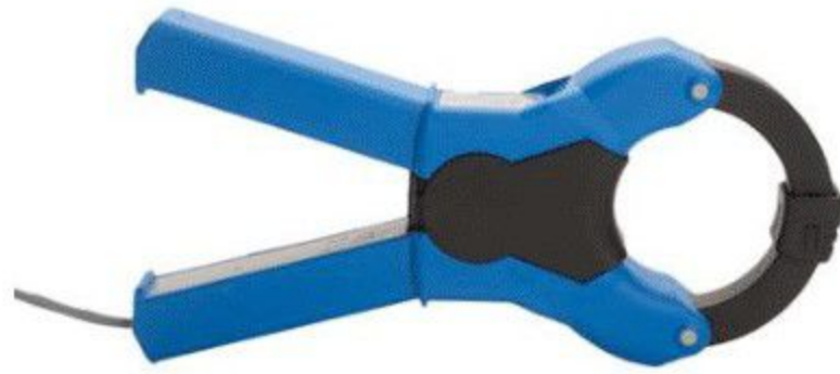
TR-2500B 10A-500ARMS CT