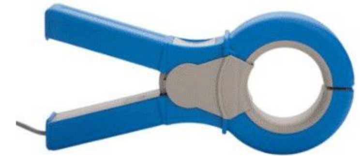
TR-2530B 20A-300ARMS CT