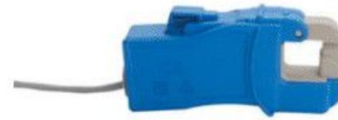
TR-2501B 100 mA to 1.2ARMS-CT